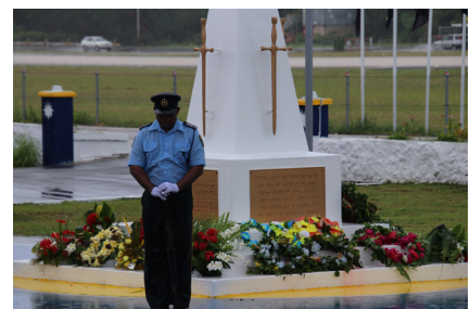
Nauru Police stand guard at Remembrance Day, 11 Nov