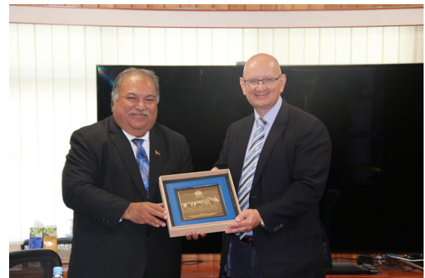
His Excellency President Baron Waqa meets with Australia's Shadow minister for immigration Shayne Neumann

The productive meeting was paired with a tour of the three RPCs to which the shadow minister was pleased to have been given the