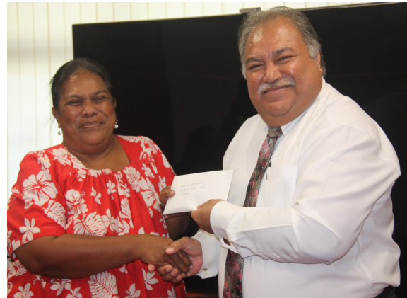
On behalf of the Able-Disable School, teacher-in-charge receives funds to be dedicated to the school's music program

The President thanked the groups, in the vernacular, for their participation and acknowledged the value of the tribal system and events such as traditional competitions that showcase ones tribe.