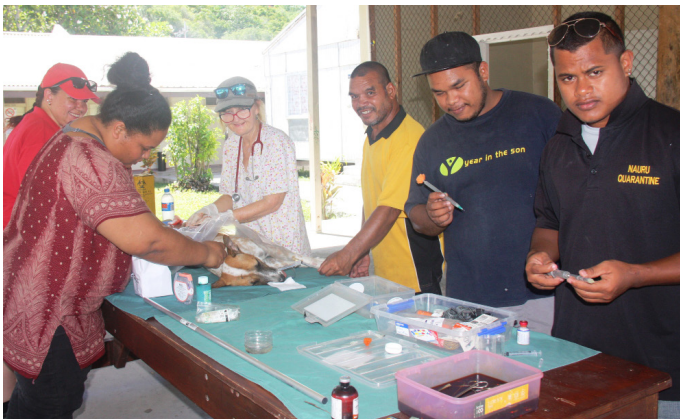
One Health dog management team in the operating theatre at the Nauru public health centre