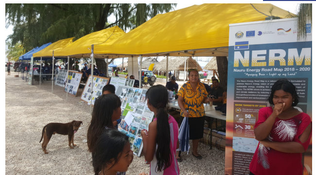
Department of CIE conclude Eben Omo campaign with final roadshow at the Aiue Boulevard

Nauru Post continues to increase its services to better serve Nauru and uphold their aspiration as ‘the people’s post office’ •