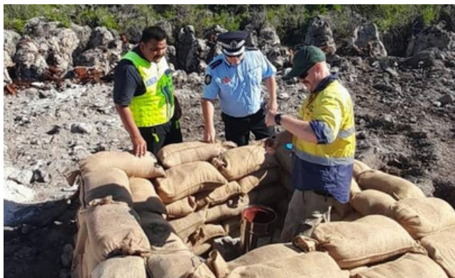
Government partnership ensuring public safety

Minister for National Emergency Services (NES) Jesse Jeremiah updated Parliament that the latest 100- pound UXO found at the NRC dumpsite, 13 March, was successfully rendered safe thanks to the coordinated efforts of the National Emergency Operations Centre (NEOC) and the Nauru Police Force (NPF) Explosive Ordnance Disposal team.