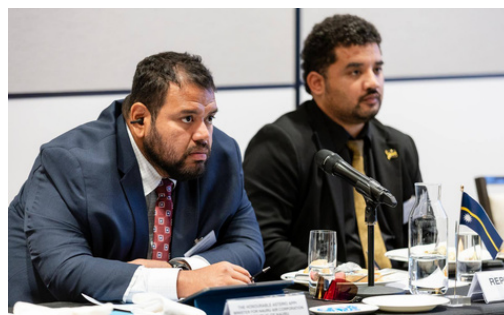
Summit focus on long-term sustainability of North Pacific Connector

Aviation travel for Nauru and the Pacific is shaping up to deliver more opportunities for tourism and official travel as ministers reaffirmed during the North Pacific Aviation Summit that aviation is critical for the North Pacific’s vast and isolated islands, but agree there must be cost-sharing arrangements.