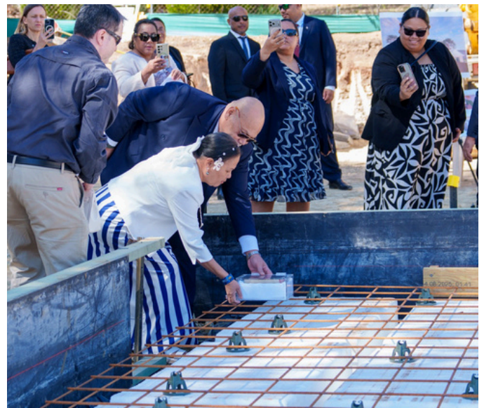
Minister Aingimea leads delegation in placing Bibles and holy water in chancery foundation

The chancery design is a replica of the main government office building in Nauru. The minister explains the deliberate choice of design carries deep national significance, ensuring that although miles away from home, the chancery will stand as a familiar symbol and a physical reflection of sovereignty, good governance and national identity.