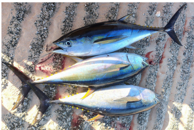
Fisheries records strong revenue results

Minister for Nauru Fisheries and Marine Resources Authority (NFMA) Reagan Aliklik reported to Parliament, 26 March, the overall performance of the public entity notably the strong revenue results recorded by the oceanic fisheries division for the current financial year.