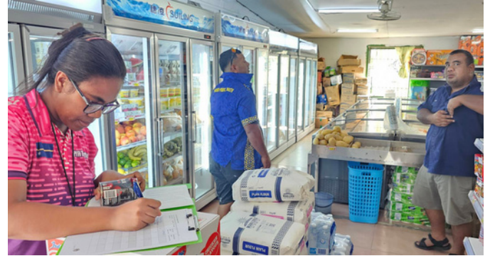
Health inspections of retail shops ensure food safety standards