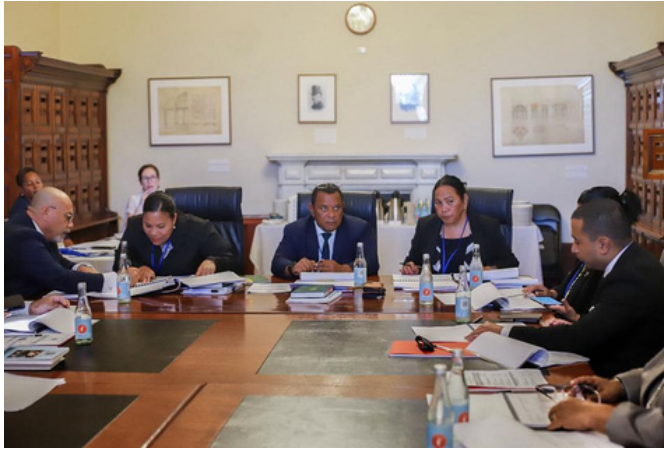
The draft review will be tabled in Parliament

Speaker of Parliament Marcus Stephen delivered a progressive statement to Parliament, 26 March, in regard to the review of the Standing Orders Committee which underwent its first major review bringing it up to par with contemporary legislative requirements.