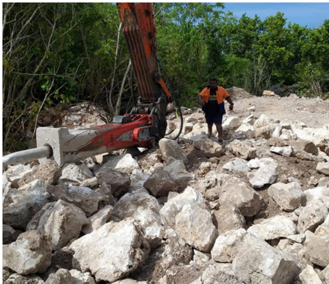
NRC working on land leveling