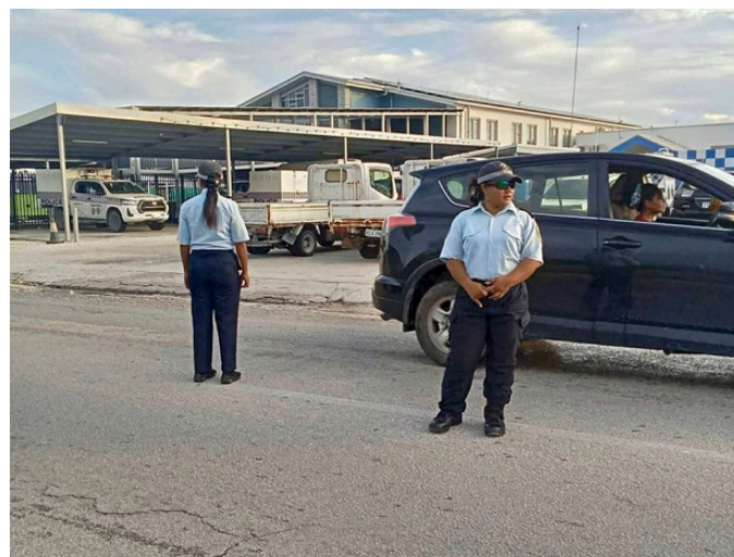
Violation and vehicle impounding maintain safer roads

Minister for Police, Lionel Aingimea presented a summary of criminal activities and traffic violations for January and February this year, revealing critical insights into the current state of public safety and law enforcement on Nauru.