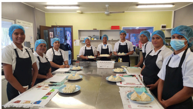
Nauru VTPD first in Pacific to attain TAFE Qld qualification

The Department of Vocational Training and Professional Development (VTPD) is making a mark with the range of training opportunities and graduates over the past year of its establishment.