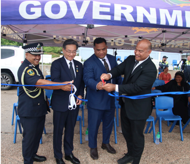
(L-R) Police Commissions Imram Scotty, Japan Ambassador Hiroshi Tajima, acting Minister for Police Delvin Thoma, and President David Adeang, perform the ribbon cutting officially launching the Japan donated police patrol boat.

Minister for Nauru Police Force, Lionel Aingimea expressed sincere gratitude to the Government of Japan for the generous contribution of an aluminum catamaran patrol boat, significantly building on Nauru's commitment to maritime security.