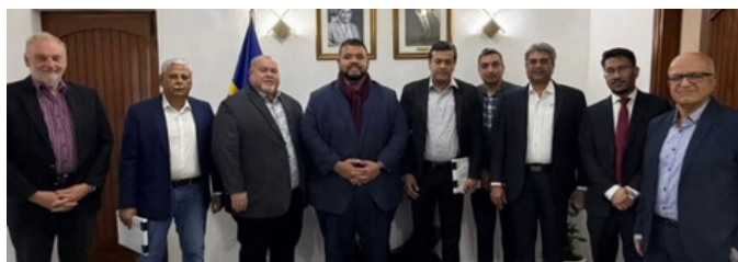
The six-year arrangement will expand business opportunities and reinforce cargo infrastructure across the region.

Nauru Air Corporation this month entered a six-year arrangement with Chennai-based air cargo transporter AFCOM Holdings Ltd., unlocking new economic opportunities for the country and the wider Pacific region.