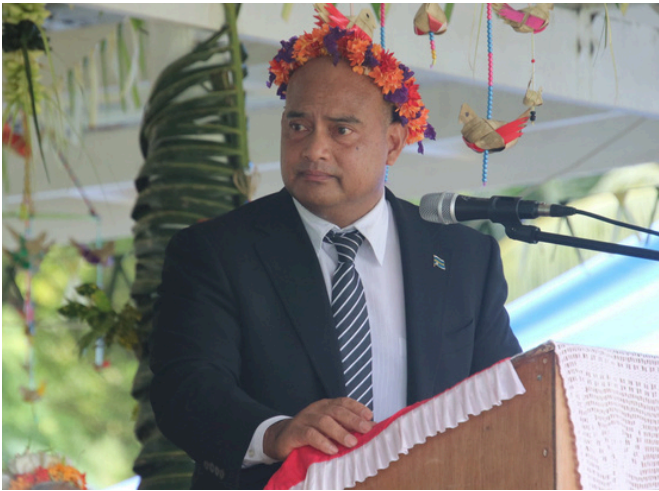
President Adeang acknowledges spiritual and ancestral connection between Nauru and Banaba

His Excellency President David Adeang joined Banaban leaders and communities in commemorating the 80th Anniversary of Banabans' arrival on Rabi Island, a significant milestone reflecting resilience, identity, and enduring cultural ties, 15 December.