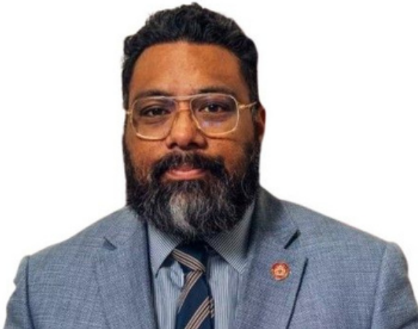
Lord Fakafānua elected new Tonga PM

On behalf of the Government and people of the Republic of Nauru, His Excellency President David Adeang extended warmest congratulations to Lord Fatafehi Kinikinilau Lolomana'ia Fakafānua, on his election as Prime Minister of the Kingdom of Tonga.