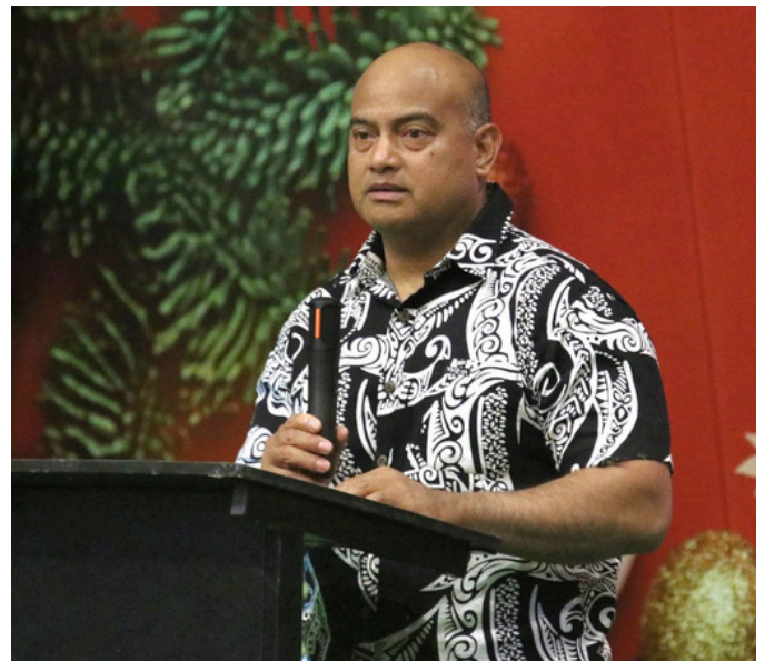
President Adeang proposed deeper engagement with churches to address social issues