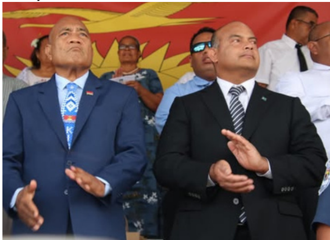
Kiribati President Maamau and President Adeang at the flag raising ceremony

His Excellency President David Adeang was honoured to be a guest at the 46th Independence Day celebrations of the Republic of Kiribati, held at the Betio Sports Complex, 14 July.