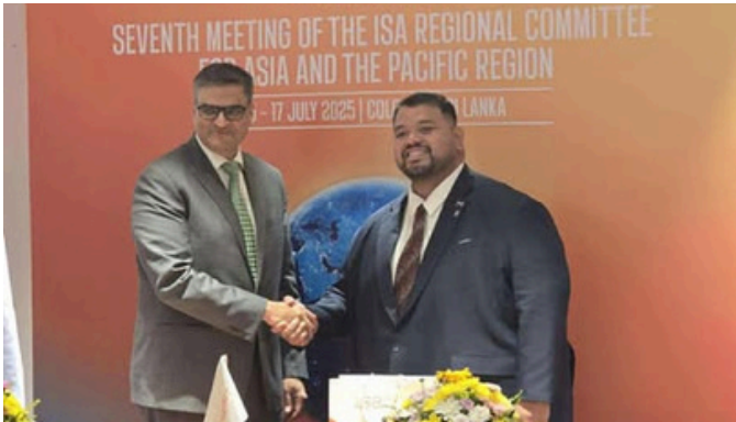
Minister for Climate Change Appi says Nauru seeks to deliver real and measurable benefits

Nauru has taken a significant step toward accelerating its clean energy transition by officially signing on to the International Solar Alliance (ISA) Small Island Developing States (SIDS) Solar Platform at the 7th ISA Asia and Pacific Regional committee meeting in Colombo, Sri Lanka, 17 July.