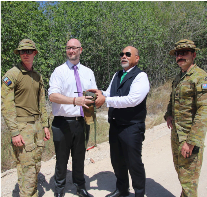
Australian High Commissioner Barclay and Foreign Minister Aingimea dispose of the UXO

The successful disposal of the unexploded ordnance discovered in the southern district of Boe signaled the end of the state of disaster declared on 16 July.