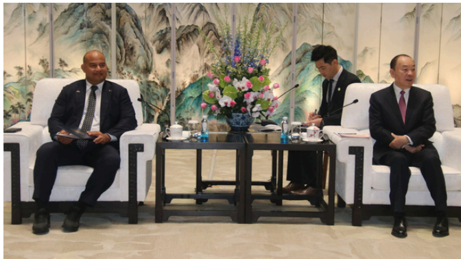
President David Adeang and Secretary Huang Kunming

President David Adeang says the government's decision in January 2024 to re-establish diplomatic relations with China has paid great dividends for the nation, and told Nauruans to expect more economic prosperity.