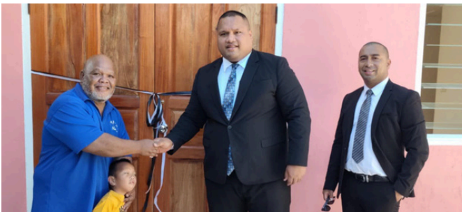
Home owner receives key to first new design Red Zone house

Infrastructure minister Jesse Jeremiah updated Parliament at the last sitting on the department's ongoing work under the Government Housing and Red Zone relocation programs.