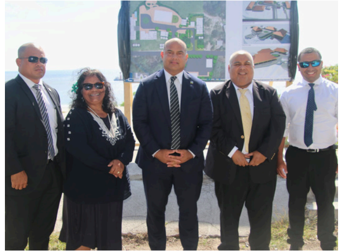
The official residence of the president will include a cabinet room, guest house and staff quarters

The concept plan for the State House was officially unveiled, 4 July, and is envisioned to be a landmark design blending modern amenities with rich cultural heritage.