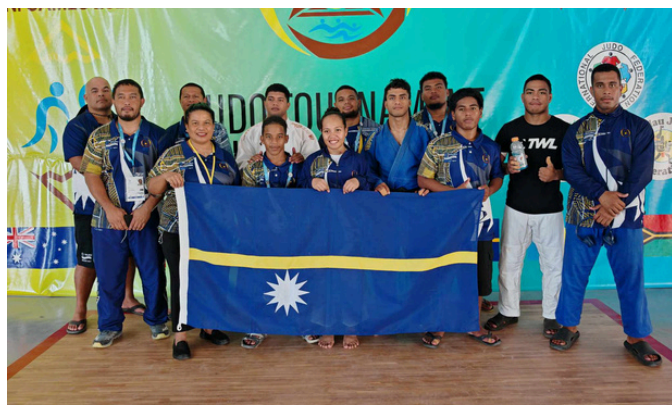
Team Nauru secured 38 medals at the Palau Mini Games