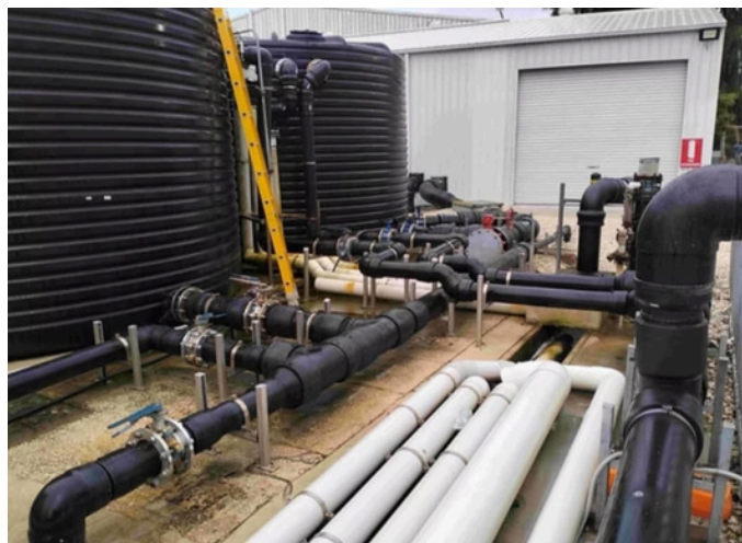
Water production line at NUC

The Nauru Utilities Corporation is producing power at an optimal level, averaging 3.6 million kilowatt hours per month, while consumer demand peaks at 6.3 megawatts, Minister Reagan Aliklik said at the 25 July Parliament sitting.