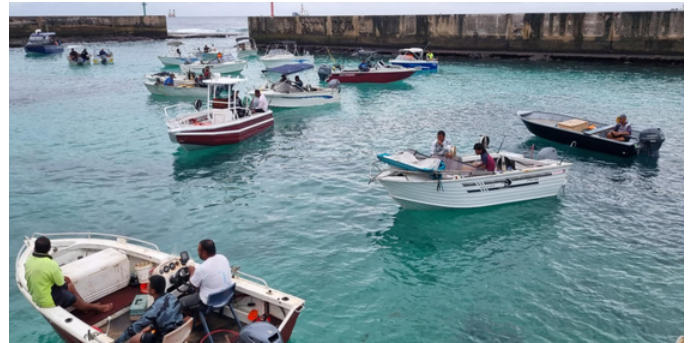
Fisheries contribute to national revenue and is an important part of Nauruan lifestyle and food source

State-owned entity Nauru Fisheries and Marine Resources Authority (NFMRA) is progressing projects with the priority being the Coastal Fisheries and Aquaculture Regulations which it anticipates will be completed by year end.