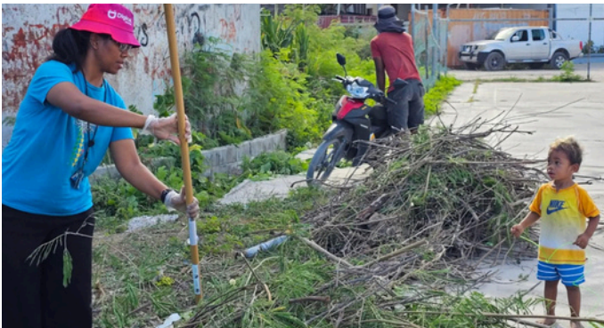
The health department leads massive cleanup campaign to rid hotspots of mosquito-breeding rubbish

As dengue fever continues to spread across the Pacific, Nauru recorded its first two fatalities on 30 July.