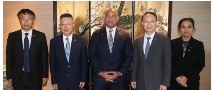
President Adeang (centre) with Nauru and Chinese ambassador

President David Adeang informed the Parliament of his official visit to Guangdong Province, China from 7-10 July.