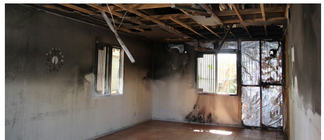
Fire damage estimated to be $25,000

The Lands and Survey office is assessing damages after an electrical fire from a split air-conditioning unit broke out in its conference room around 8pm on Thursday, 1 May.