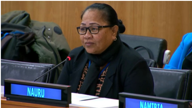
UN Ambassador Daniel highlights imbalance in UN security membership

Nauru reaffirms support for a comprehensive reform of the UN Security Council and calls for a seat for Small Island Developing States.