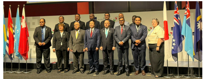
Nauru supports MVI adoption as guiding metric for international assistance

Nauru raised concerns of graduation from the Organisation for Economic Co-operation and Development (OECD) list of Official Development Assistance (ODA) recipients, at the 2nd Japan-Pacific Islands Finance Ministers' meeting on 5 May.