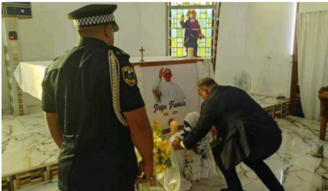
President Adeang lays wreath at Pope Francis mass

The Government and people of the Republic of Nauru join the global community of the faithful in mourning the loss of His Holiness Pope Francis.