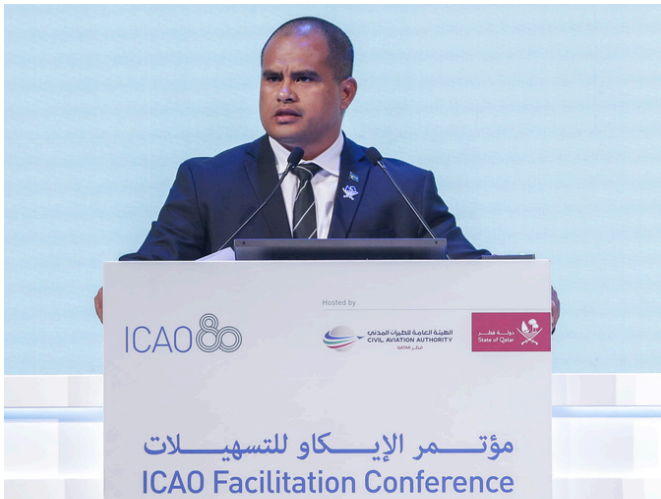
Minister Aliklik says conference theme resonates deeply with Nauru

Nauru reaffirmed its commitment to regional cooperation on air transport and the need for greater support to building resilience and capacity within the Pacific aviation sector.