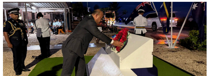
President Adeang lays wreath at 110th Anzac day anniversary

'They shall grow not old, as we that are left grow old: Age shall not weary them, nor the years condemn. At the going down of the sun and in the morning. We will remember them'.