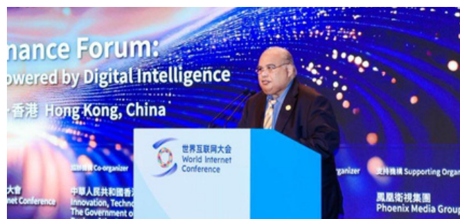
Minister Bernicke looks to a future in digital financial technology

Nauru highlights commitment to creating a supportive technological framework focusing on digital growth at the 2025 World Internet Conference Asia Pacific summit in Hong Kong, 14-15 April.