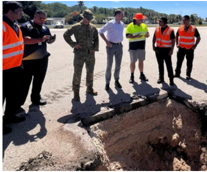
Anomalies along runway proving low risk

The ongoing work on the airport runway of investigating and removing anomalies has not unearthed any Unexploded Ordnance (UXO) to date.