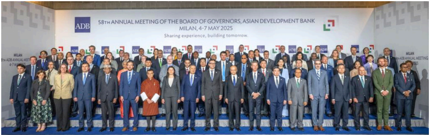
HE President David Adeang attends annual ADB meeting as governor for Nauru

ADB58: Annual governors meeting address collective action to solve complex challenges