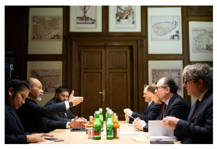
Foreign Minister Aingimea in bilateral meeting with Austrian counterpart

A bilateral meeting between Nauru and Austria marks significant step in fostering diplomatic relations between the two nations.