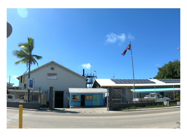
Power production exceeding consumer demand

Power generation by the Nauru Utilities Corporation (NUC) is producing capacity exceeding consumer demand with solar energy contributing 10 per cent. This is still expected to increase with the launch of the new six-megawatt solar project in April, up surging renewable energy to 50 per cent, and improving operational efficiency.