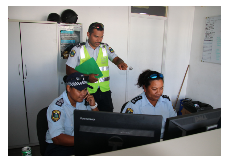
Police officers prepare schedules for festive period patrol

Police presence serves as a deterrent to potential disturbances and a reassuring sense of security for families and friends gathering to celebrate. //