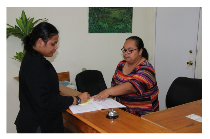
NUC staff assisting customers during royalty payments

The state-owned entity, Nauru Rehabilitation Corporation (NRC) is clearing its debt to landowners for rock royalties which commenced on 17 December, 2024.