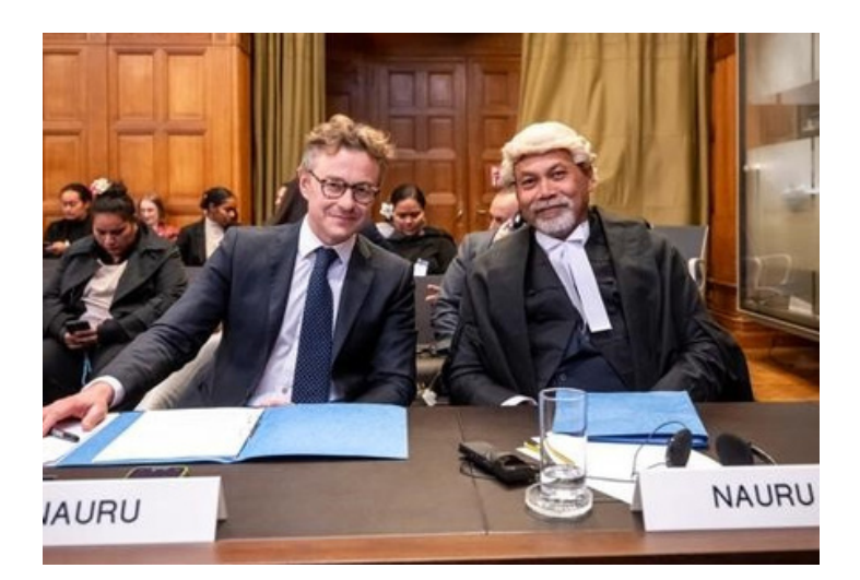
Minister Aingimea and legal counsel Bjorge present Nauru's case on climate threats to SIDS

Nauru urged the ICJ to use the moment to set a legal precedent that safeguards vulnerable states, and as emphasised in its submission, "The ICJ has the opportunity to reaffirm that the rule of law protects the weak against the excesses of the powerful. Its guidance is critical for a just and sustainable future".