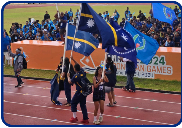
Team Nauru celebrates at the closing ceremony of the 10th Micronesian Games in Majuro

Nauru's medal haul at the 10th Micronesia Games is the highest medal count in any Games it has participated in, according to games officials.