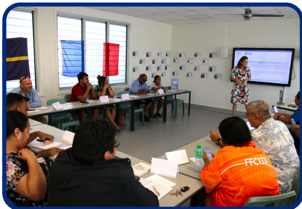
Discussions hope to gauge participant points of view of what Nauru's environmental issues are

The Department of Foreign Affairs & Trade and the Suva-based French Embassy held a Blue Talk session with various government officials and local stakeholders on ocean policies and environmental issues within Nauru's context, 28 June.