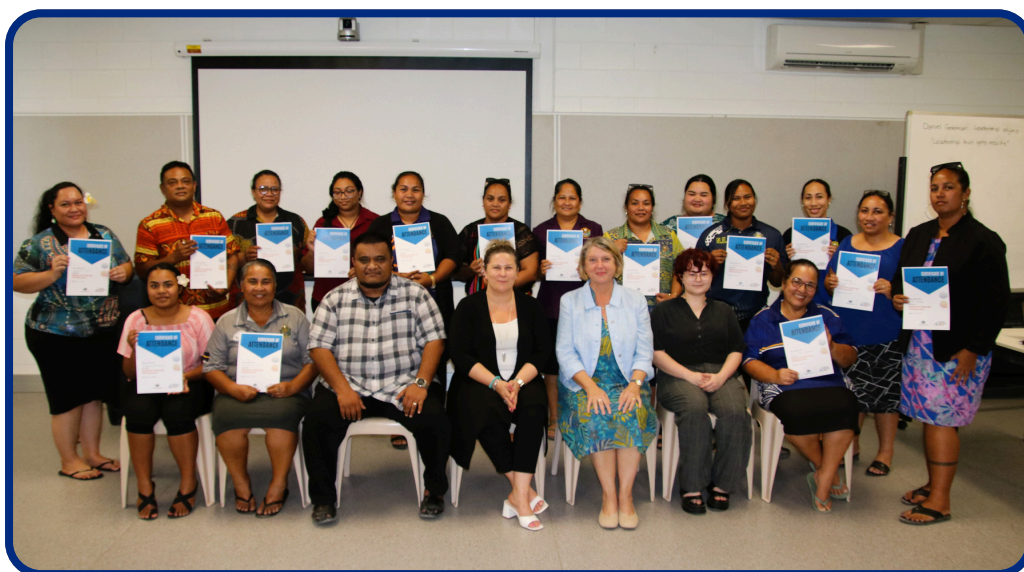
Training helps employees understand qualities and behaviours to boost office performance

The training program is funded by Australia's Department of Foreign Affairs and Trade and logistically supported by Nauru's Office of the Chief Secretary. //