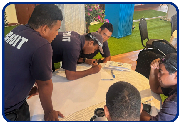
Police recruits in problem-solving group work