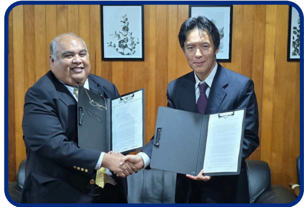
ICT Minister Bernicke and Ambassador Michii exchange notes formalising additional grant for undersea cable project

Minister for Information and Communication Technology Shadlog Bernicke and Ambassador of Japan to Nauru Rokuichiro Michii formalised an additional grant for the East Micronesia Undersea Cable (EMC) project in a signing ceremony, 5 July.