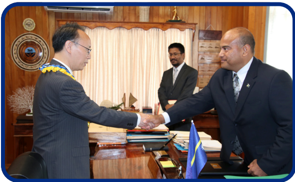
President Adeang receives the Ambassador's letter of credence