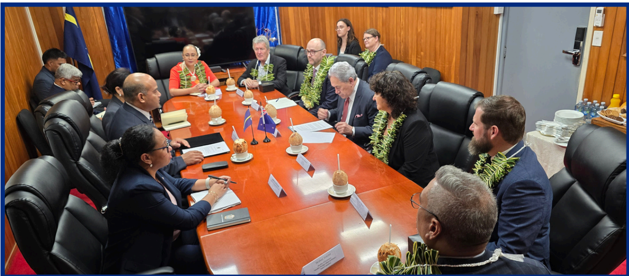
President David Adeang and NZ Deputy Prime Minister Winston Peters discuss cooperation and addressing challenges

Opportunity to focus on challenges during Pacific Reset tour