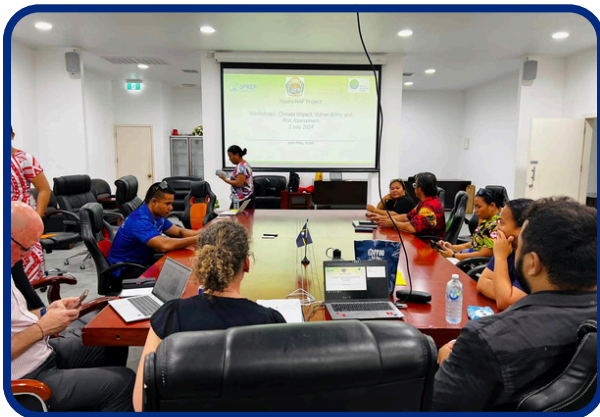
Participants learn to identify issues and discuss solutions

The Department of Climate Change and National Resilience (DCCNR) launches workshop aimed at gaining a deeper understanding of climate impacts in Nauru's context, 2 July.