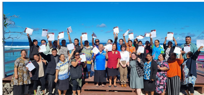
Participants of the workshop show off their certificates of completion

"We also brought in some additional information on how to analyse data and how to use it better, which is incredibly timely given that the census is just been released. So there's this whole new rich data set for public servants to use."