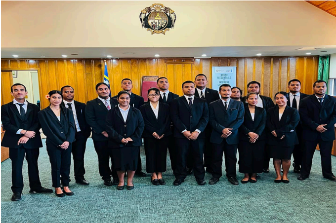
Nauru Youth Parliament members following their first sitting in parliament chambers

Nauru Youth Parliament (NYP) held its first ever sitting in parliament chambers and introduced a new bill, 23-25 August.