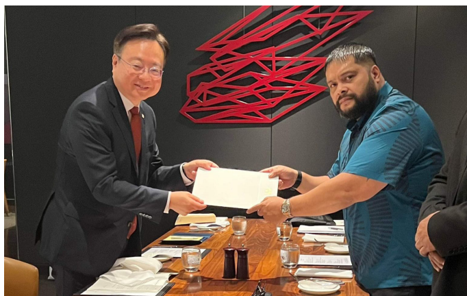
President Kun and Korea Minister discuss Health priorities

Other areas will include public health refurbishments and training of health professionals •