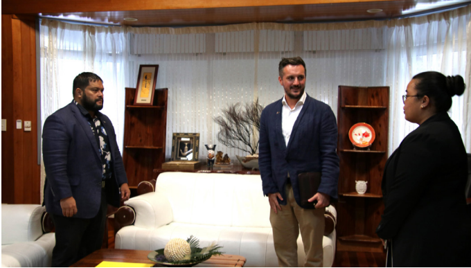
President Kun receives British HC Thomas Coward at the Office of the President