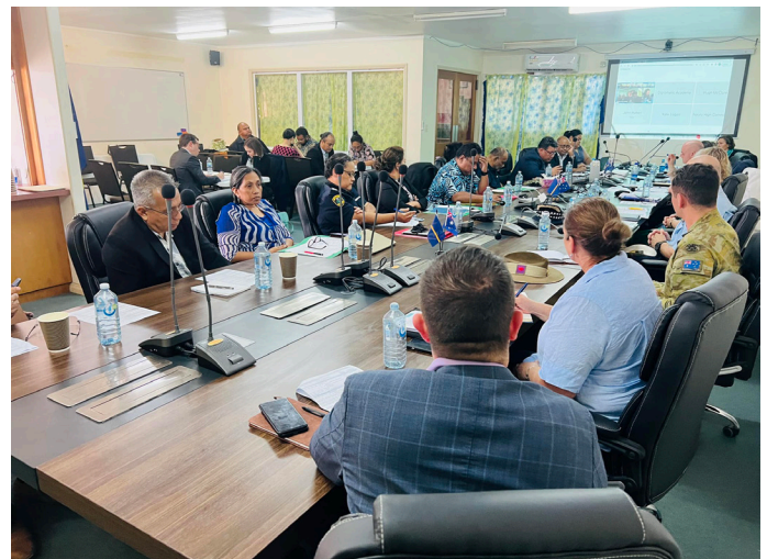
Key government departments and stakeholders discuss priority areas with representatives from the Australian government

This marks the first consultation held between the two new governments •