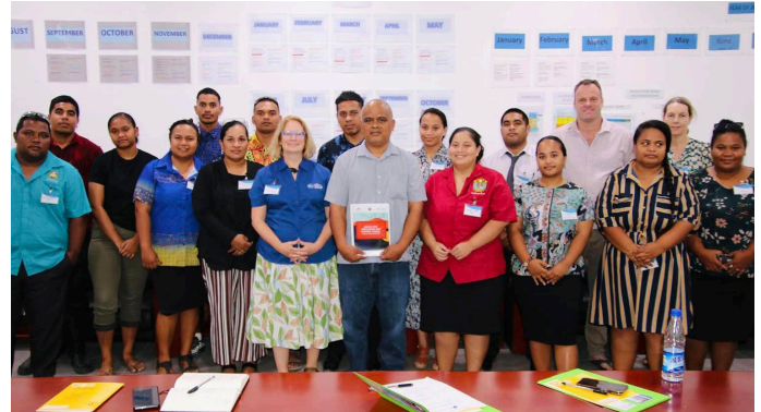
Stakeholders participate in the workshop for statistics reading and interpretation

The Nauru Bureau of Statistics (NBOS) and the Pacific Community (SPC) successfully completed a three-day joint workshop for statistics reading and interpretation, 29 August – 1 September.