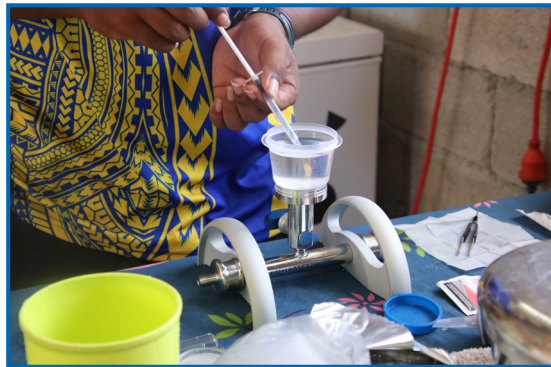
MICS team member performs water quality testing for one of the selected houses

A team of experts from UNICEF arrived a few months earlier to conduct a four-