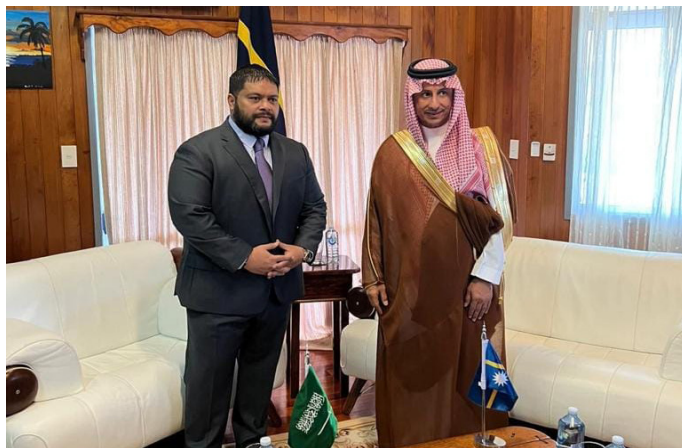
Saudi Minister Khateeb meets President Kun on his short visit to Nauru

Saudi Arabia's Minister for Tourism Ahmed Al Khateeb paid a courtesy call on His Excellency President Russ Kun and Cabinet Ministers, 31 August.