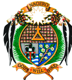
The national anthem and emblem bill makes necessary corrections in relation to the depiction of the national emblem

President Aingimea tabled the final Bill amending schedule two of the Naoero National Anthem Emblem and Flag Protection Act 2018 citing errors relating to the depiction of the national emblem.