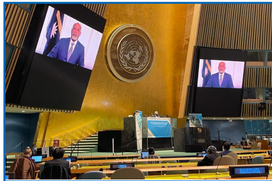
President Aingimea's pre-recorded statement is televised at the UN highlighting weaknesses of SIDS during COVID-19 and calls for better working approaches

"The work of the UN is important to Nauru and we see the relevance of the UN's