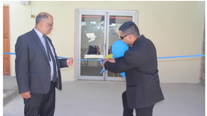
Minister Eoe cuts the ribbon officially opening the new office premises of the public prosecutor and public defender

"Our government is committed to ensuring that every sector of the justice system is developed to make justice more accessible to people," Minister Eoe said.