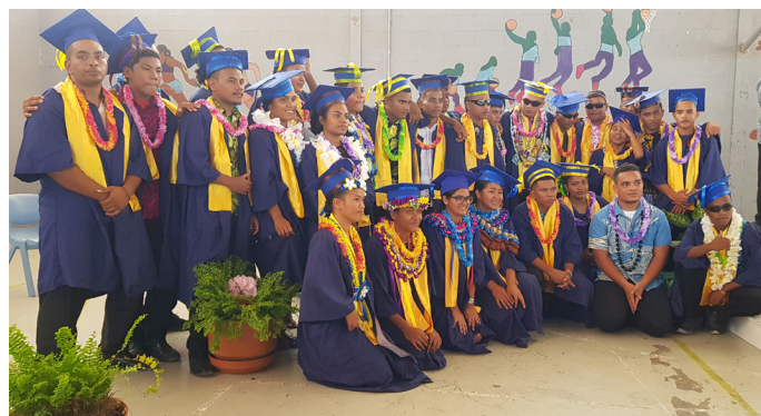
Of the group of year 12 NSS students, 30 graduated with a Queensland Certificate of Education

To graduate with a QCE, students are required to take up subjects in years 11 and 12, recognised by the Queensland Curriculum and Assessment Authority. Students must achieve the set amount of learning, at the set standard, in a set pattern, while meeting