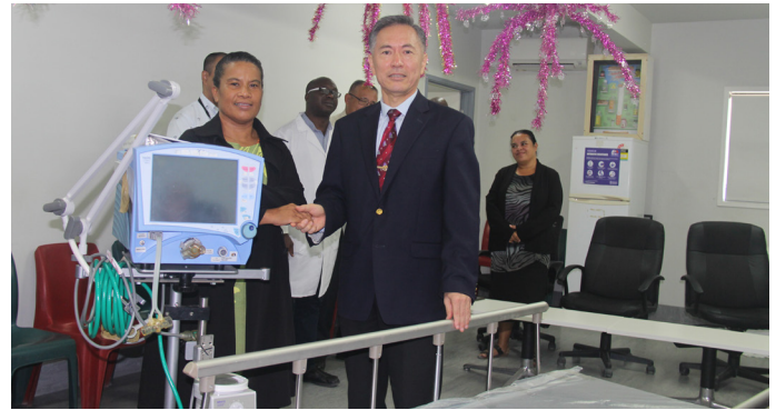
The high range ventilator and 18 hospital beds with mattresses are earmarked for the COVID-ready negative pressure unit

The donation is part of Taiwan's ongoing commitment to assist Nauru in any way it can and especially for COVID-19 needs and requests by the Nauru government.