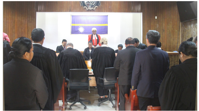
The legal fraternity acknowledge the difficulties of 2020 posed by COVID-19 and commend the perseverance and positive work of the court staff