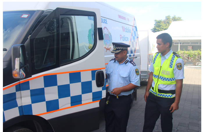
Nauru Police will be able to better conduct traffic related testing and checks with the new beat vehicles and trailers