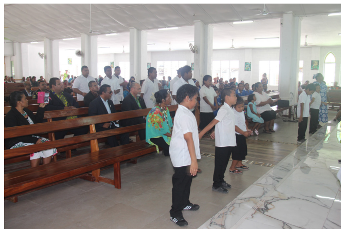
Students of the Able Disable Centre perform an action song during mass

The 2020 IDPWD theme, 'Not all disabilities are visible' also focuses on spreading awareness and understanding of disabilities that are not immediately apparent, such as mental illness, chronic pain or fatigue, sight or hearing impairments, diabetes, brain injuries, neurological disorders, learning differences and cognitive dysfunctions, among others.