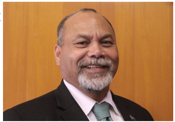
Nauru President Lionel Aingimea and incoming USP chancellor says the investigation against the university's vice-chancellor is preposterous and reeks of bad faith

"We must allow the institution... to govern itself by what it teaches. So, if we say we're all for good governance, then let good governance have its say. If we're all about correct ethics, then let that have its way. If we say we've got a law school and we're teaching law to students to come out and follow the law,