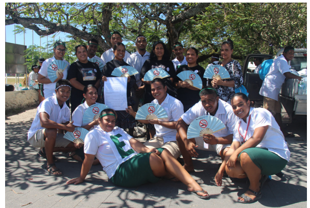
NSS year 11 and 12 students pose for photo with health minister Isabella Dageago following their ‘I don’t smoke’ campaign at the government office

NSS head boy then presented a student-signed “I don’t smoke” request to Minister Dageago, while the head girl presented another to the President.