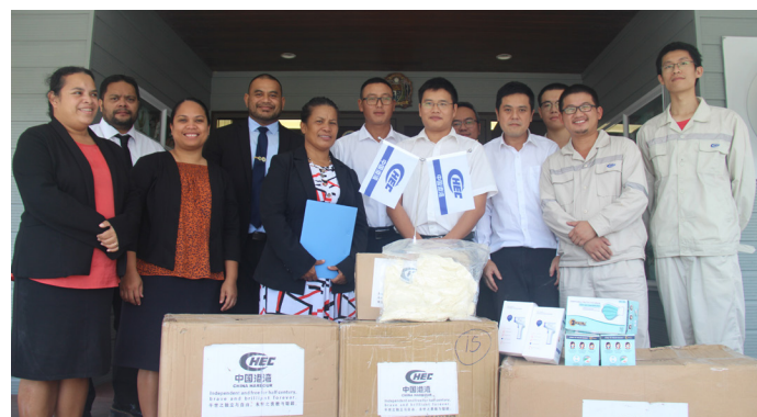
Nauru port contractor China Harbour Engineering Company (CHEC) donate personal protective equipment for frontline workers supporting Nauru's efforts to protect against COVID-19