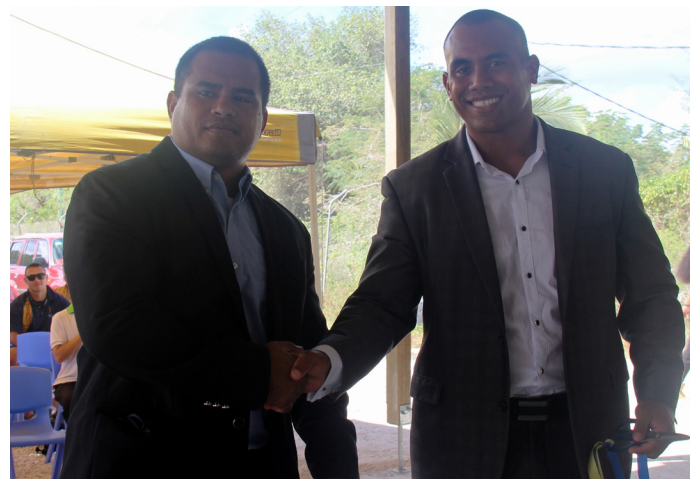
NRC Minister Aliklik and CIE Minister Gadabu celebrate the establishment of Nauru's first waste segregation station

"I commend the Commerce, Industry and Environment Department and the Nauru Rehabilitation Corporation for your tireless commitment towards the preservation and protection of the environment in ensuring the people of Nauru are safe.