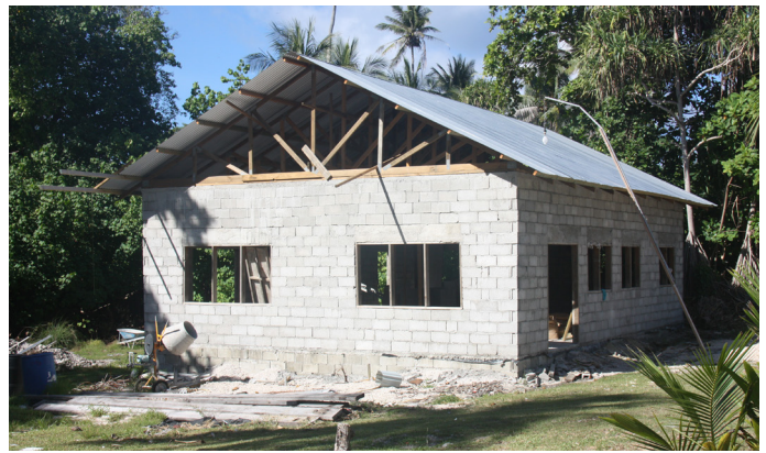
The community housing scheme is provided $5.6m

“The different percentage changes relates to the removal of pay discrepancies between the salary bands. There will be no increase in salaries for those on special pay, or those in the Department of Multicultural Affairs,” Minister Hunt said.