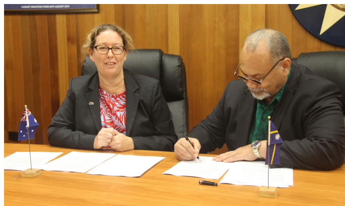
Australia continues to strongly support Nauru with an estimated total amount of $23m for FY2020-21.

The ADB is expecting to provide an overall assistance of $35.5 million for 2020-21 including $8 million for general budget