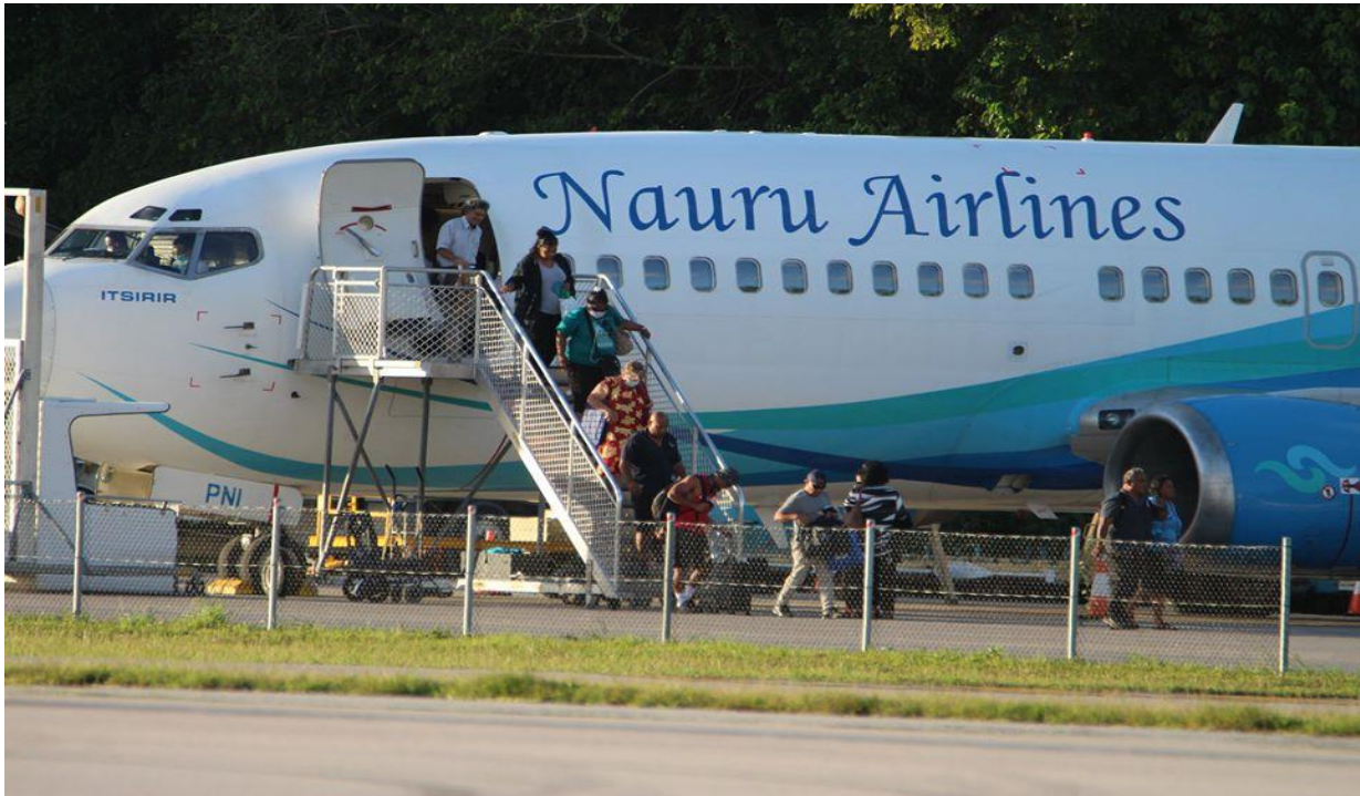
All arriving passengers are taken to transit accommodation for 14 days quarantine. The Nauru Government is diligently working to repatriate Nauruans abroad.