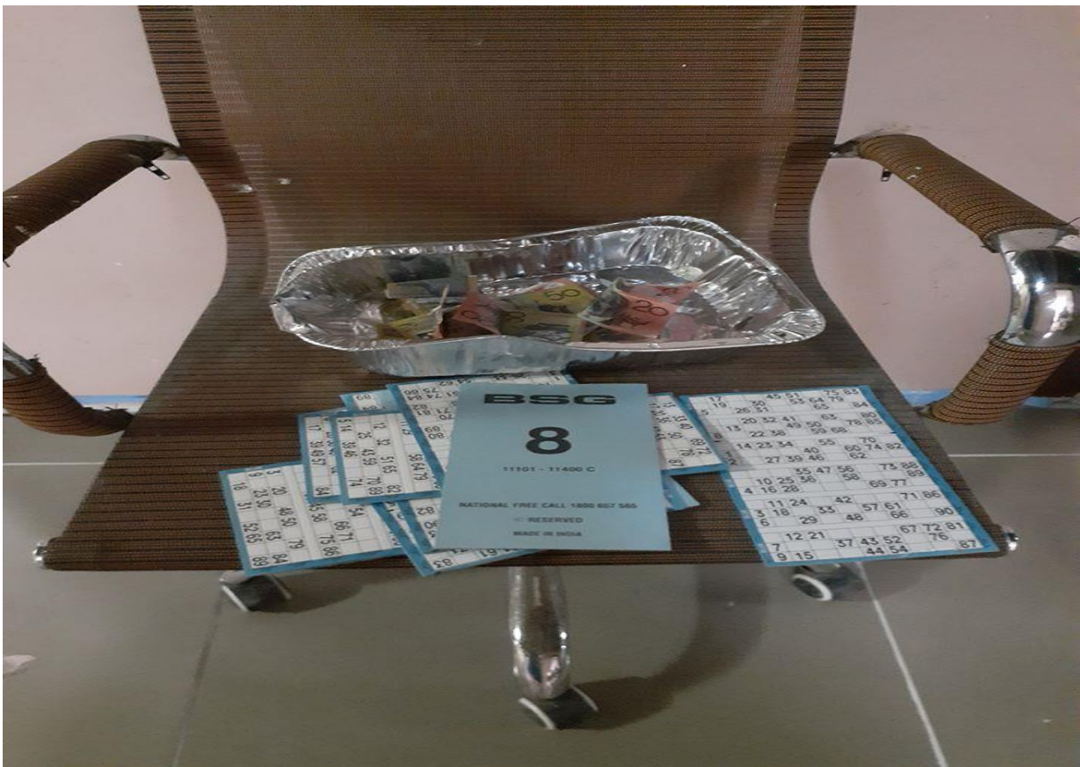
Residents in quarantine at the Budapest hotel play a game of bingo for entertainment