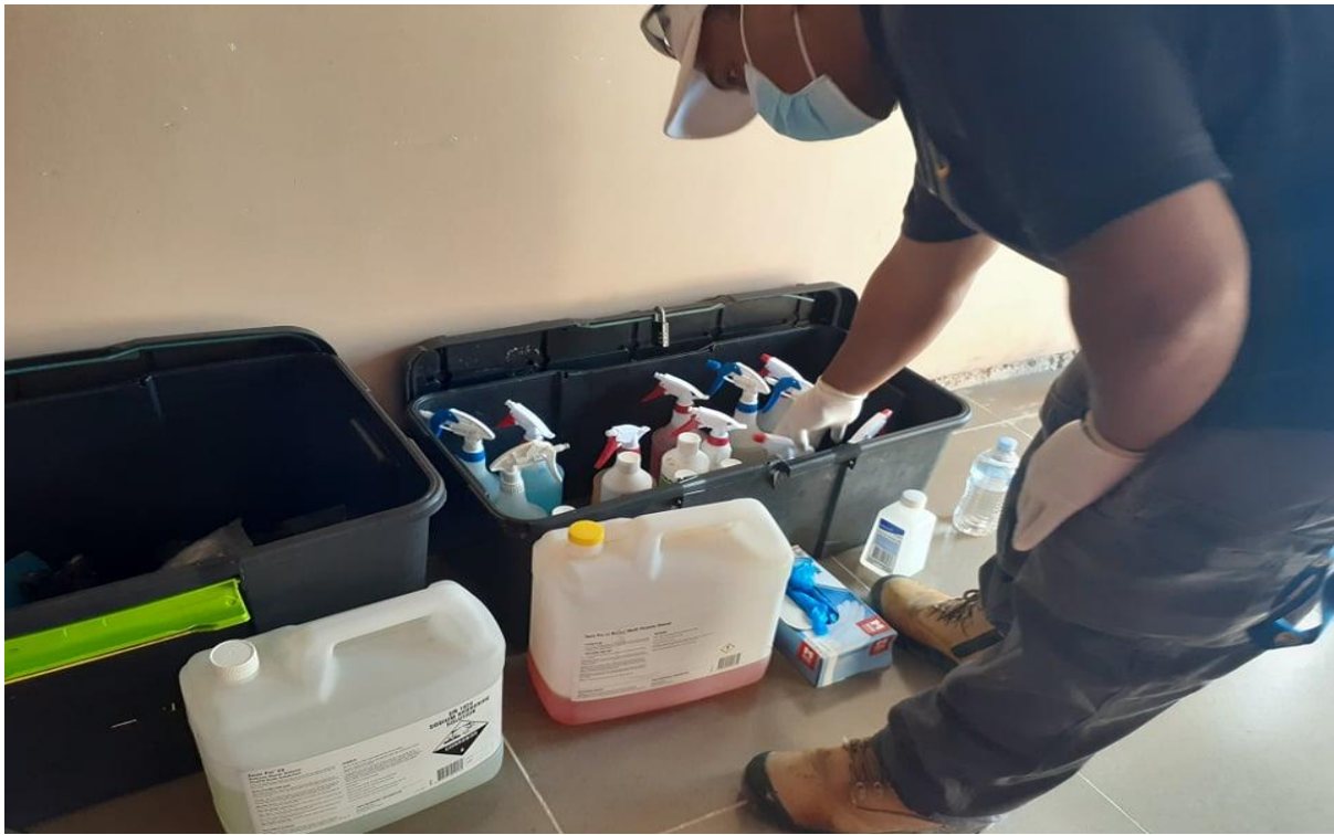
Daily thorough cleaning at the transit accommodation, Budapest Hotel