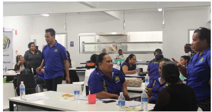
Nauru Media conduct health promotion and media training workshop with health staff

In the workshop, participants developed a media plan with messages and products targeting various key health issues, such as eye health, sexual and reproductive health; health eating – kitchen garden and; diabetes.