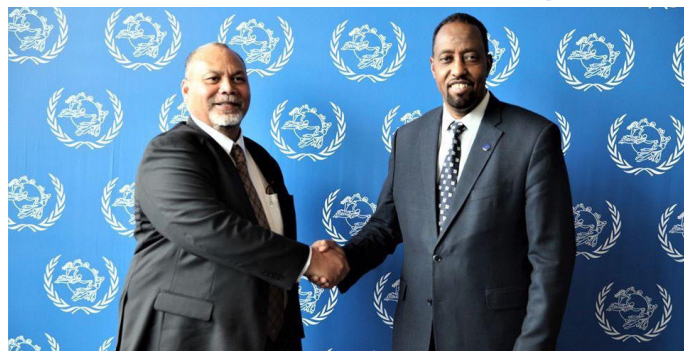
President Lionel Aingimea with UPU Director General Bishar Abdirahman Hussein

President Aingimea further explained the government is seeking to pass amendments to the Naoero Postal Services Corporation Act to readily permit Nauru Post to expand its service offerings, including international funds transfer and insurance like services