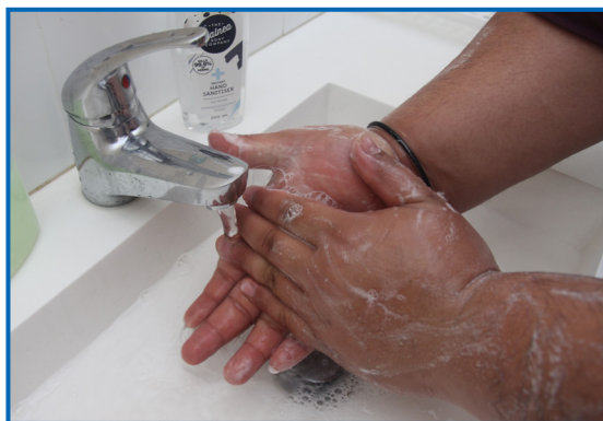
The World Health Organisation recommends hand washing with soap, use hand sanitiser, cover coughs and sneezes and practice social distancing

President Aingimea thanked Taiwan as well as the Government of Australia for its financial assistance of $100,000 to support Nauru in purchasing test kits and other associated products to be used for disease prevention in the wake of COVID-19.