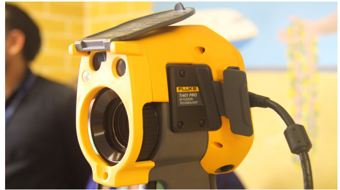
Arriving passengers walk pass the thermal imager scanner which detects high body temperature

The thermal scanners are procured from medical equipment suppliers Global Doctors in Malaysia with the assistance of