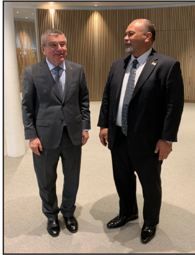
President Lionel Aingimea with IOC President Thomas Bach at Olympic House

On the margins of officially opening Nauru's mission in Geneva in February, His Excellency President Lionel Aingimea made a courtesy visit to the International Olympic Committee House in Lausanne, Switzerland and later the Swiss Confederation.