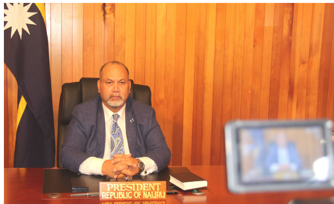
Following the declaration of a State of Disaster, President Lionel Aingimea delivers address saying the "government has taken every step possible to ensure the protection of its people against Coronavirus"

Cabinet has also made Regulations under the National Disaster Risk Management Act 2016 to give effect to the declaration. The Regulations came into effect on 16 March.