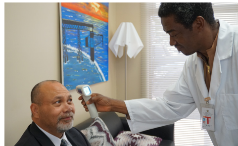
President Aingimea leads by example and gets tested upon arrival at the airport terminal amid COVID-19 prevention measures