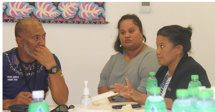
Minister for Youth Affairs Isabella Dageago in discussion with stakeholders about the youth program, Blue Light

As the program caters to 11-16 year olds, it is technically outside the jurisdiction of Youth Affairs, whose target demographic is 18-35 years.