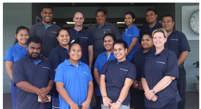
Treasury staff pose for a photo in shirts provided by FMIS supplier TechnologyOne

"That asset register has been handed over now and we're putting