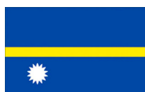
Republic of Nauru

The GIO was established in May 2008 and is a section of the Office of the President.