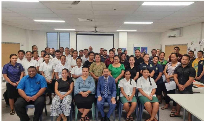
Climate workshop participants shared adaptation measures to address concerns of the different sectors

The Nauru Government requested technical assistance from CCFAH to enhance the institutional capacity to facilitate improved access to climate finance in order to meet priority needs for securing sustainable development for Nauru.