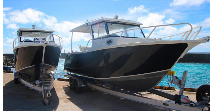
Nauru Fisheries acquire new vessels through the US Treaty Development Fund

The Nauru Fisheries and Marine Resources Authority (NFMRA) received two fishing vessels and presented prizes for a fishing competition, in celebration of the authority’s 25-year anniversary, 11 July.