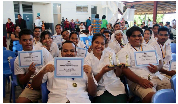
Students show off their certificates at the annual academic awards day

Speaking in the vernacular, she told students to keep on achieving in education because as you grow academically, we also grow with you.