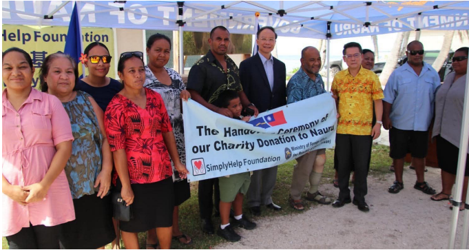
The donation by Taiwan organisation, Simply Help Foundation will be distributed among the disability community

The delivery of the $30,000 consignment was facilitated by the Taiwan Embassy who also covered the delivery costs.