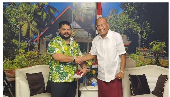
President Russ Kun with Kiribati's President Taneti Maamau

“As Kiribati takes this remarkable step towards independence, we, the