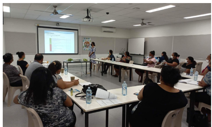
Teachers and school caterers attend health workshop

These include health giving foods which consists of fruits and vegetables, energy giving foods which consists of bread, pastries and oats, and body building foods which consists of meats and protein.