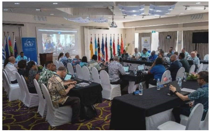
Officials discuss priorities set by aviation ministers to achieve the vision to improve air connectivity and economic growth for Pacific peoples

The face-to-face meeting is tentatively scheduled for early November 2023.