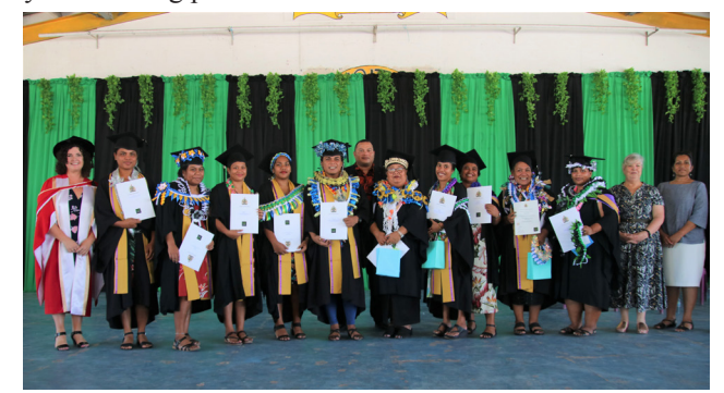
Over 50 Nauruan students have graduated from UNE through the Nauru Teacher Education project

"The skills, knowledge and experience that you have gained on this journey have not only enriched you as an individual, but will be making a difference in the lives of the students you will cross in your teaching paths."