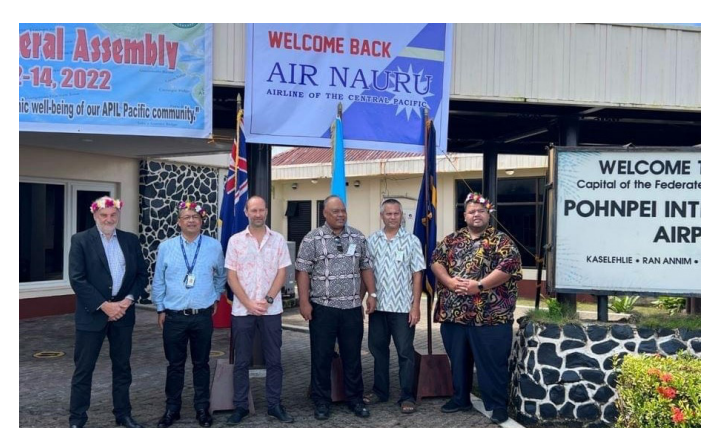
FSM representatives welcome the Nauru delegation at Pohnpei international airport

Fortnightly flights to Nadi, Fiji also resumed on 23 October thus provide the opportunity for Nauruan and Fijian families to reconnect and business to pick up again •