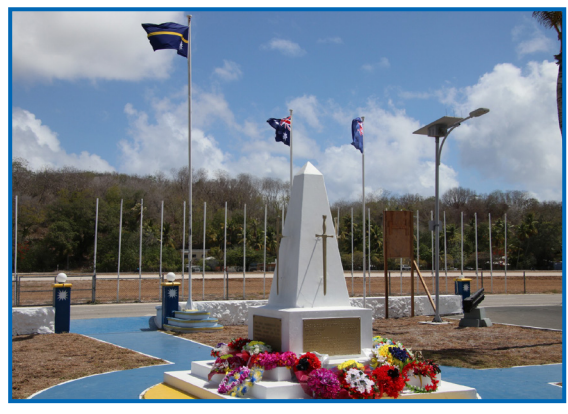
Public laid wreaths at the cenotaph

The ceremony was by part, led by the Nauru Police Force as the Memorial Guards hoisted the flags of Nauru, Australia and New Zealand.