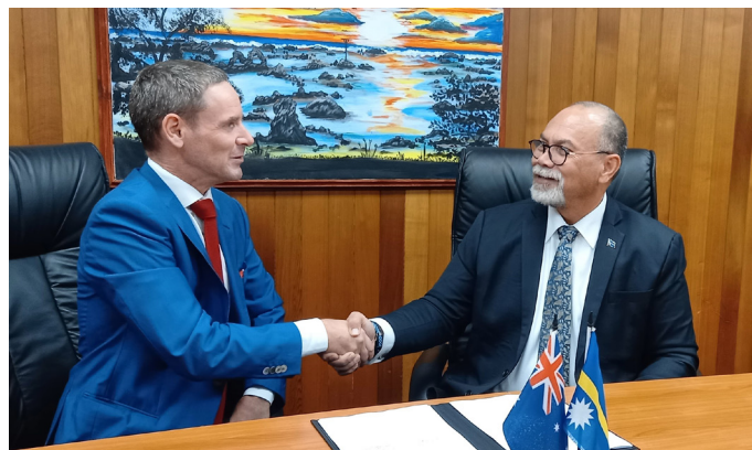
President Lionel Aingimea and Deputy Australian High Commissioner Andrew Hodges sign runway upgrade grant provided through AIFFP

The upgrade includes resurfacing of the runway and upgrade some critical air traffic control equipment; as well as climate-resilient upgrades to sections of the ring road.