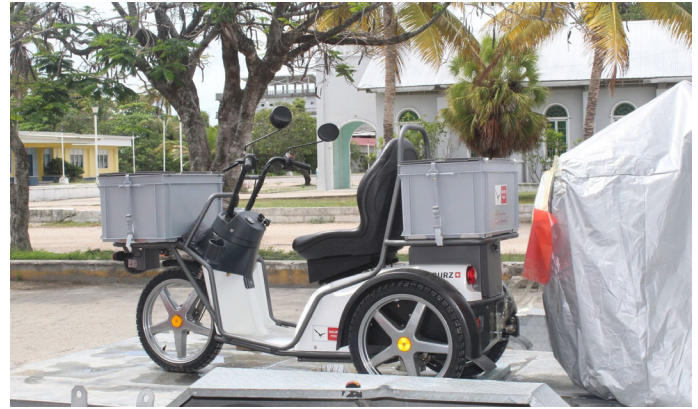
Switzerland-gifted electric bikes can travel up to 45 kmh

The bikes can travel up to 45km/h and are fitted with protected carry units for light packages, helping the Nauru Postal Service increase its capacity to serve Nauru by delivering inbound mail to its customers.