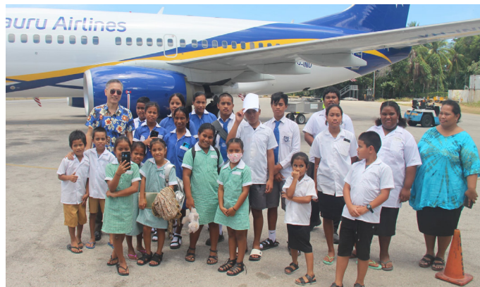
Taiwan Ambassador Dean Wang and students on the first scenic flight to Banaba Island on board VH-INU

Following the detection of two COVID-positive cases in quarantine a day earlier, from individuals who travelled on an incoming flight, authorities say there was no exposure between