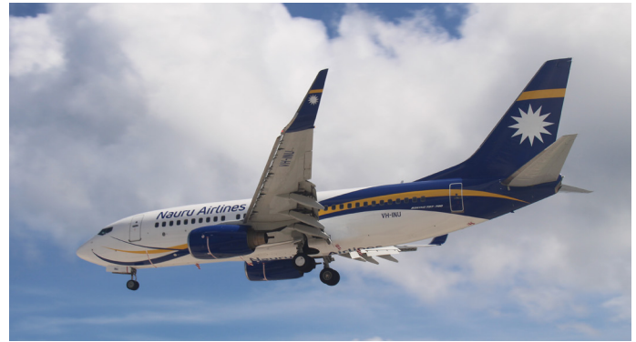
A second Boeing 737-700 series aircraft is in the pipeline for Nauru Airlines

"Any new destination will have to be profitable to subsidise and help carry the Nauru Airlines' Nauru sector."