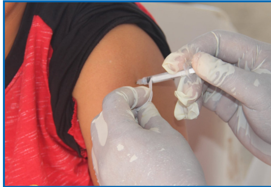
Kids vaccination reaches 90 per cent and adult booster shots 75 per cent coverage

Daily COVID testing and regular health checks confirmed that no more passengers turned into a positive case and all remained