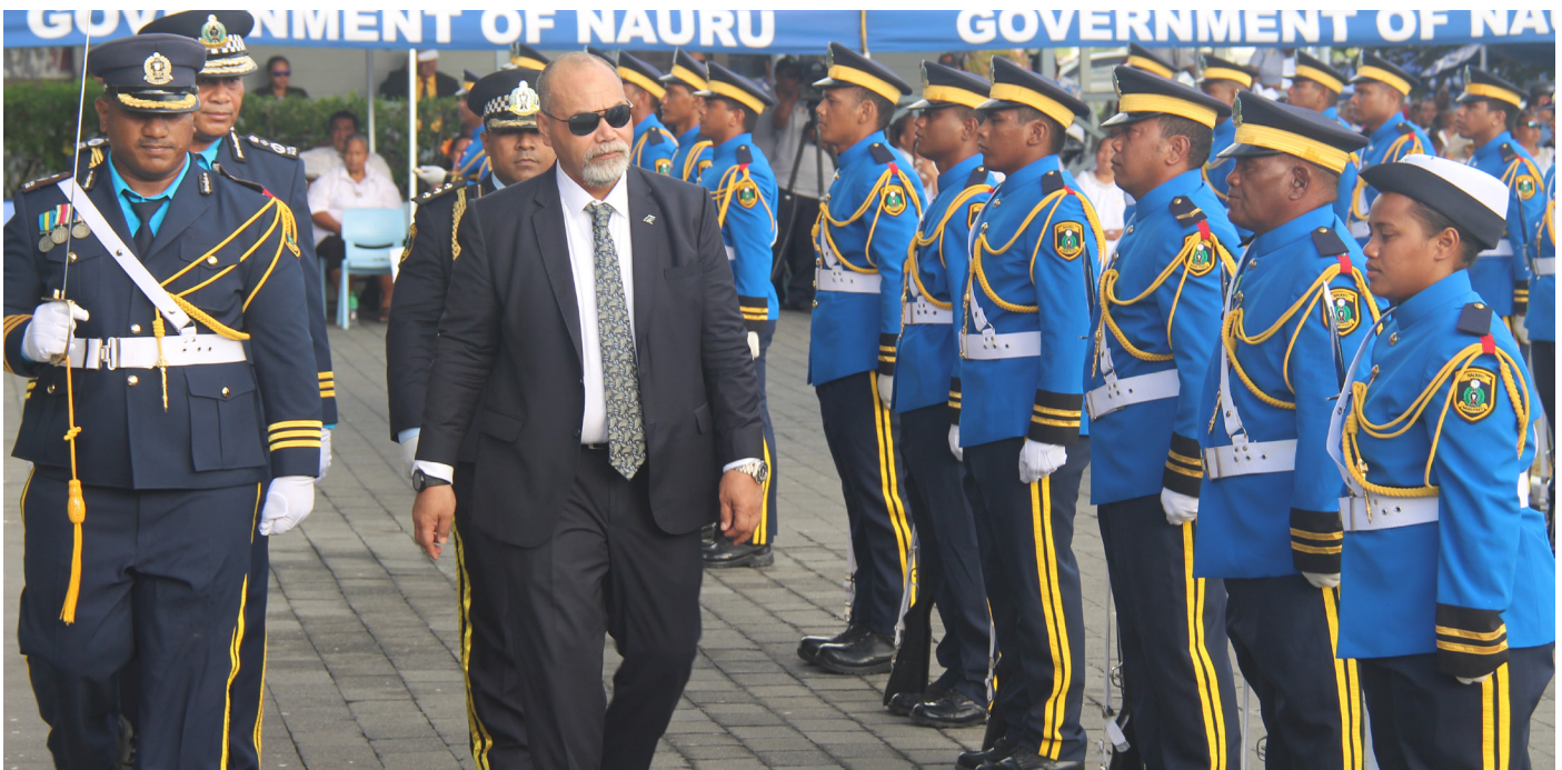
His Excellency President Lionel Rouwen Aingimea, MP., inspects the Nauru Police Force Guard of Honour at the flag raising ceremony of Nauru's 54th Independence Day and 76th Anniversary of the return from Truk, 31 January 2022

The Embassy of the Bolivarian Republic of Venezuela