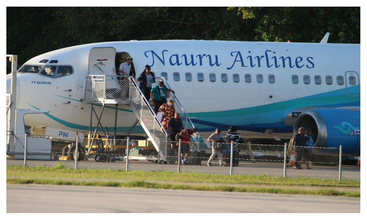
All arriving passengers are taken to transit accommodation for 14 days quarantine. The Nauru Government is diligently working to repatriate Nauruans abroad.