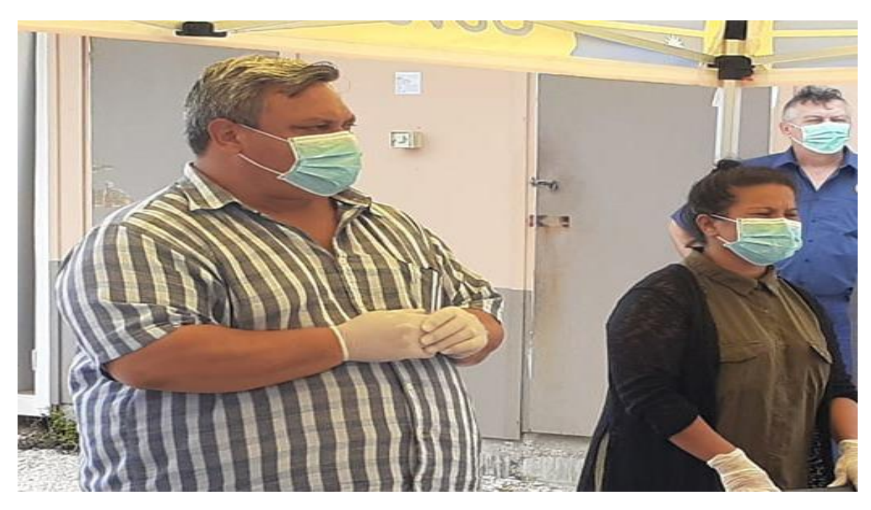
Dr Kieren Keke and Health Minister Isabella Dageago are leading the National Coronavirus taskforce. Here speaking with residents at the transit centre, Budapest Hotel