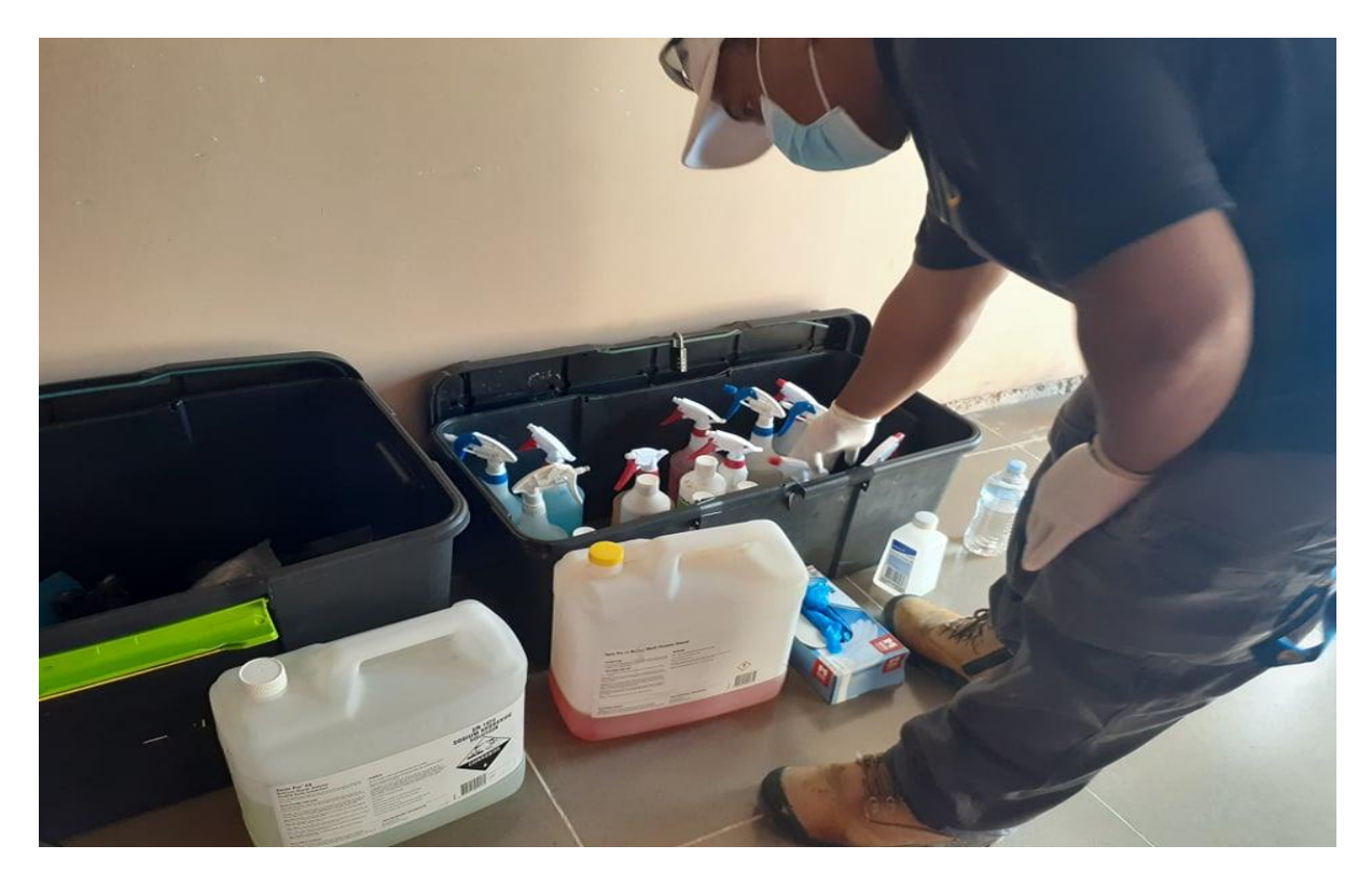
Daily thorough cleaning at the transit accommodation, Budapest Hotel