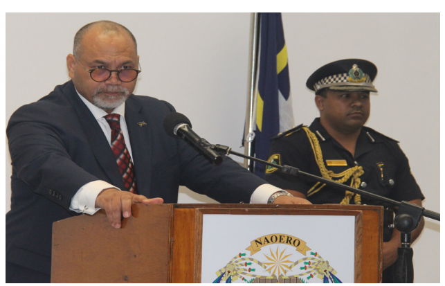
President Aingimea opens inaugural heads of mission meeting with a message of hope and drive towards sustainability