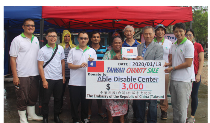
Taiwan Embassy donates another $3000 to the Able Disable Centre making it the ninth charity donation by the embassy

The chief secretary must supply a copy of each document that is intended to be submitted to the Board in response to the appeal at least seven days before the appeal is heard, and there must be a quorum of two members, one of whom must be the chairman, at a hearing •