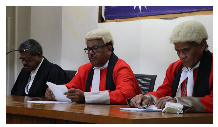
His Honour Justice Shafiullah Khan (centre) opens the 2020 legal year emphasising efficiency in the courts

Minister Eoe also highlighted the importance of the role of the courts in the economic and social development of Nauru, with