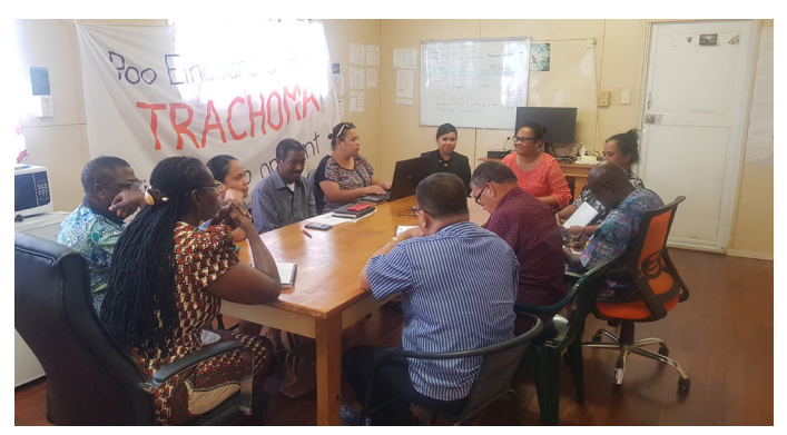
Ministry for Health called an emergency meeting to address immediate measures in response to the coronavirus epidemic

The heads of mission meeting will be an annual event •